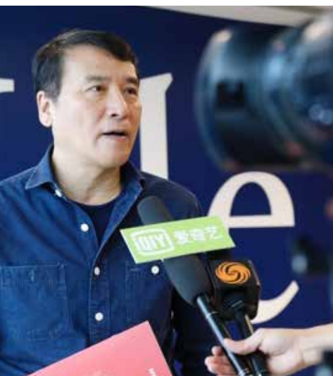
NYO-China's Honorary Tuanzhang Ye Xiaogang speaking with reporters from CCTV, iQiyi, and Fenghuang TV at the Yale Center Beijing. (7/23/2018)